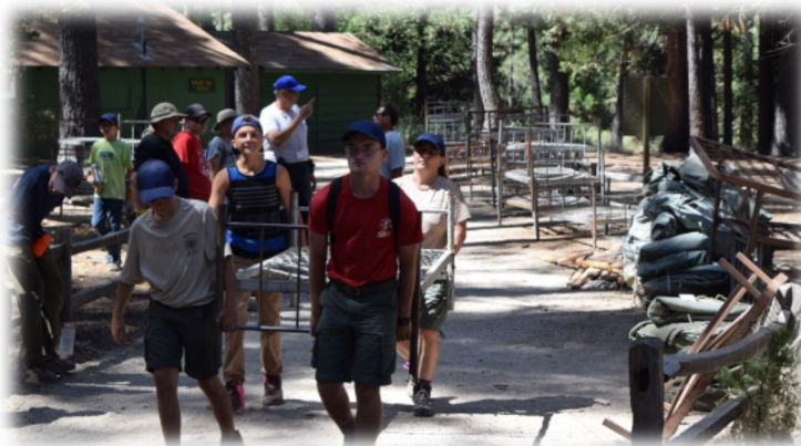
Carry, carry, carry...