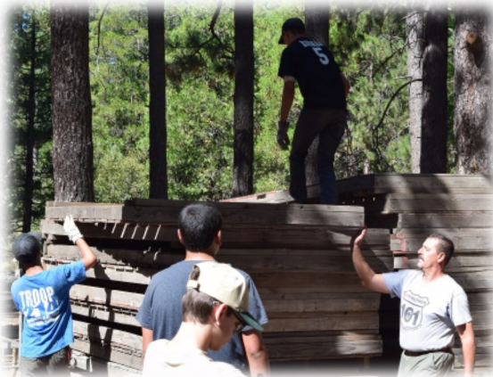
Stack, stack, stack...