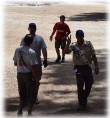
A happy Elangomat