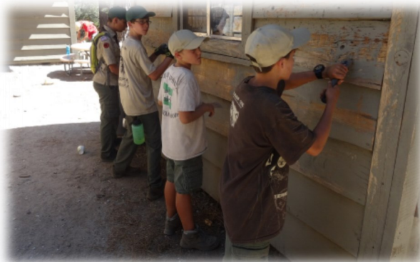
Scrape, scrape scrape....