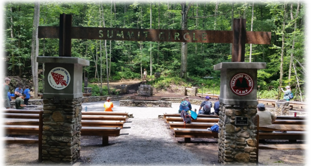
Summit Circle Entrance