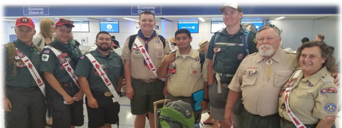
Cahuilla Lodge's PRISM Contingent

The Summit Circle at the BSR is the original ceremony circle from Treasure Island. In 2015, the site of the Order's founding was transported piece-by-piece to the Summit, and was combined with the rocks donated by lodges, past and present, to create a timeless experience that presents the Order across its 100-year history. Prism's defining experience was a personal experience at the Summit Circle, the OA's new national ceremony grounds where we participated in an inaugural rededication ceremony and reflected on the Order on our final night at the BSR. We were among the first Arrowmen to experience the new national ceremonies grounds. It was truly a unique and moving experience.