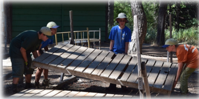
Lift, lift, lift...