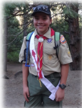
A happy, proud new Arrowman