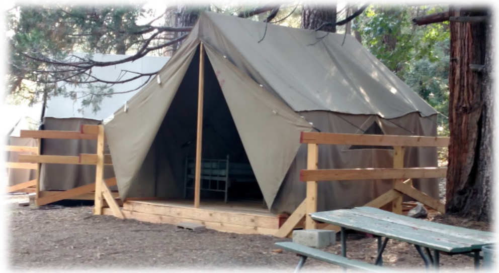
Emerson's new "Philmont" tents