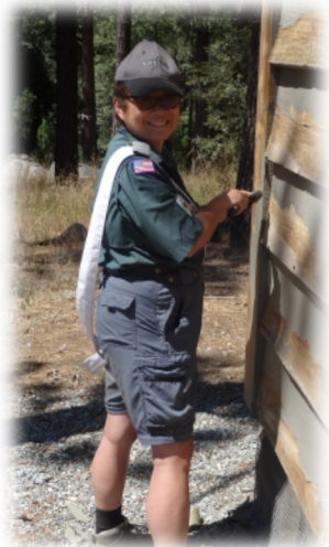
Even Antelopes scrape