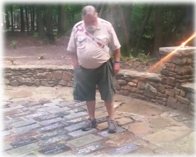
Looking for history