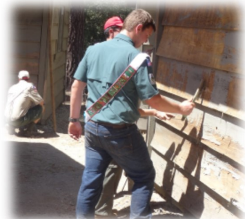
Scrape, scrape, scrape...