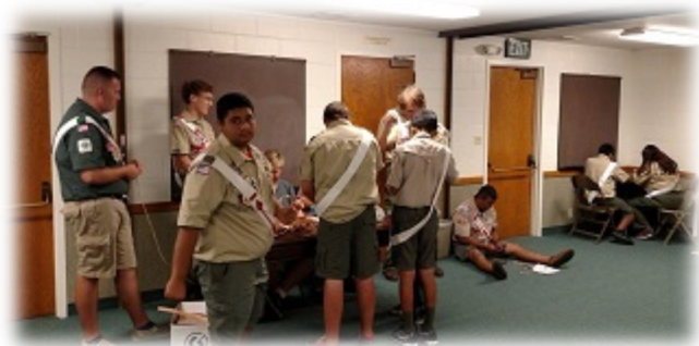
Chapter meeting making chokers